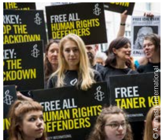
Demonstration outside the Turkish Embassy in London, UK. 12 July 2017.

Our work protects and empowers people – from abolishing the death penalty to advancing sexual and reproductive rights , and from combating discrimination to defending refugees' and migrants' rights . We help to bring torturers to justice. Change oppressive laws... And free people who have been jailed just for voicing their opinion. We speak out for anyone and everyone whose freedom or dignity are under threat.